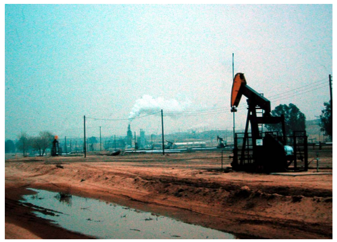
Figure 5. Secondary recovery is used in most oil fields to enhance production. Water is injected commonly and is used in Saudi Arabian fields, while steam shown here is used too. The steam plants, shown in the distance venting steam, pump steam into the oil-bearing strata and force the oil to other wells nearby where it is extracted. The technique works on heavy crude and fields that are somewhat depleted. See http://www.heavyoilinfo.com/thermal .

the more distant future. Taphonomy shows us there's not a lot left.