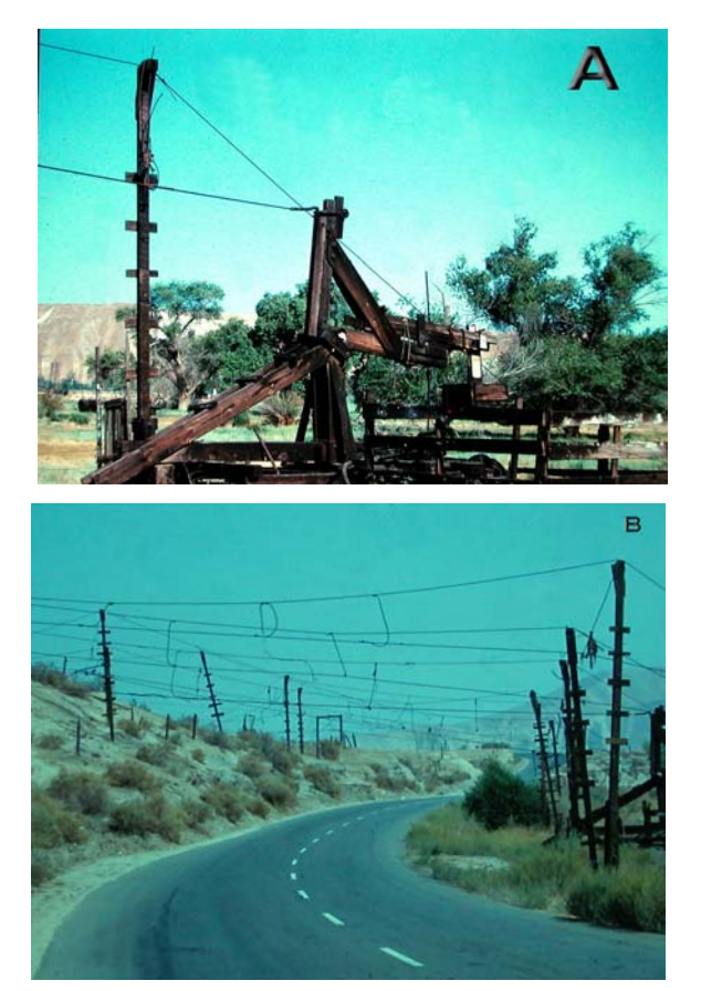
Figure 3. In the early 1900s, oil was regarded as infinite in supply, as more and more giant and super giant oil fields were discovered. Early methods of extraction included hand-dug wells, then impact tools, and finally rotary drilling bits in 1901. The wells shown here were drilled along the Kern River in central California. Like almost all wells, they require pumping to lift the oil to the surface-verv few wells flow under their own pressure which is rapidly depleted. The pumping method shown here was to link the pump jacks (A) over a wide area by cables (B) to a single engine that pulled them up and down to pump the oil. All oil costs money to produce, and those costs have grown dramatically over the history of the industry and will continue to grow as more and more difficult oil is produced. J. H. Lipps image, 1960.

much or under too much pressure, and they have to be exposed at a particular place in the Earth (road cut, hillside, etc). They do not have to experience a particular diagenetic process that changes them into something we seek; indeed we try to avoid such places. Thus far the taphonomic principles are remarkably similar between the usual fossils we study professionally and the fossil fuels we need in our ordinary lives.