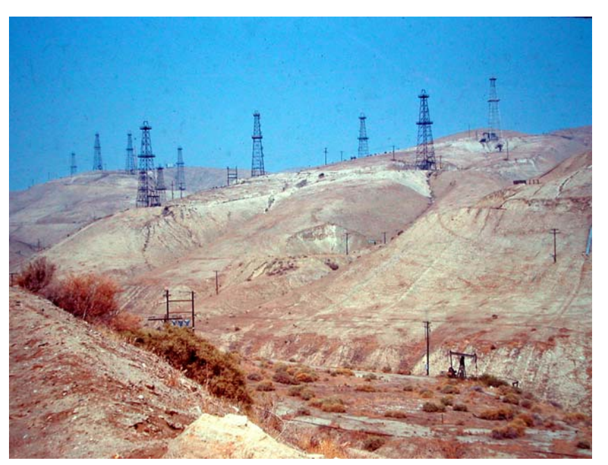
Figure 1. A California oil field. Like the rest of the world, early California oil fields were quite productive but began to lose their higher volumes in mid-century. Many of these wells were sold to small independent operators who could make them profitable. Most of these fields are still active. Here, the Round Mountain Oil Field, which has produced over 100 million barrels of oil since it was spudded in 1927, making it a "giant" field. J. H. Lipps image, 1960.

The incident made me wonder why Americans and probably people in the rest of the world are so poorly informed about oil, their primary source of energy and perhaps one of the most valuable resources they have (Fig. 1). As paleontologists, we understand these issues for the most part and we should be teaching about the problem in our classes and informing the general public and especially the politicians about it. Mostly, the oil problem