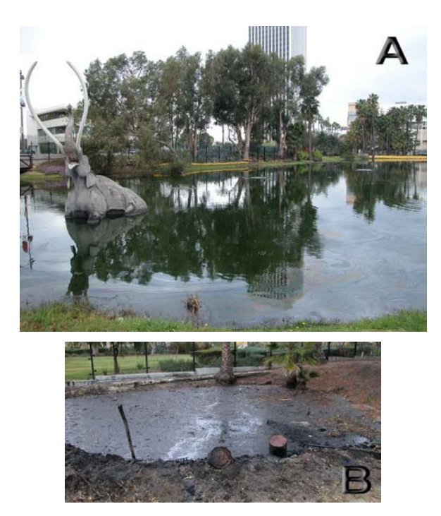
Figure 2. Probably 90% of oil formed in the sedimentary deposits of the world has migrated to the earth's surface where it formed oil seeps and pools, and eventually disappeared altogether. Here, at the famous La Brea deposits on Wilshire Boulevard (A) in Los Angeles, California, active oil seeps from underlying Tertiary rocks form pools in Pleistocene and Recent alluvium (B). These pools, like so many others in the world, have trapped animals, plants and protists in the gooey mess.

long period of time. Although the open ocean has a lot of production overall, in any particular place it is low, so low that most of the material is absorbed back into the water or degraded otherwise. Overall, the productive areas amount to about to less than 20% of the oceans today, and the most productive upwelling regions amount to a fraction of that. Even that amount of captured productivity would release us from the oil squeeze, but there's more to it naturally.