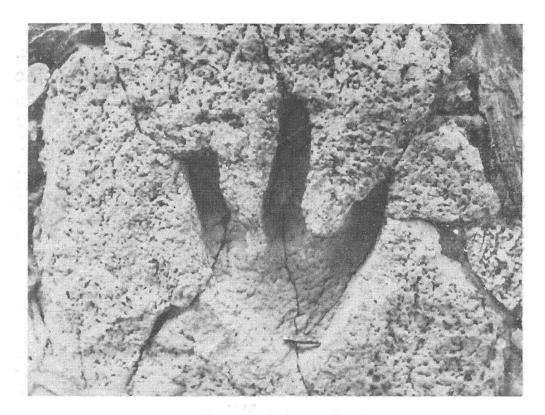
Figure 1. Dinosaur track mounted in the band stand, Glen Rose.

The track does not give positive evidence as to whether or not the toes were terminated by hoof-like or claw-like ends. The fact, however, that the mud was not largely disturbed on the withdrawal of the foot seems to indicate considerable flexibility in the toes. As the dinosaur lifted its foot, the toes automatically retracted and closed so that the track was left almost a perfect mo'd except for a slight in-push of the sticky lime mud into the opening. Undoubtedly the ends of the toes came to a fairly sharp point. The palm of the foot has a width of about 12 inches, and the cast of the foot shows that it was definitely convex. On the other hand, the cast shows that the undersurface of the toes was not developed into pads, but was flat.