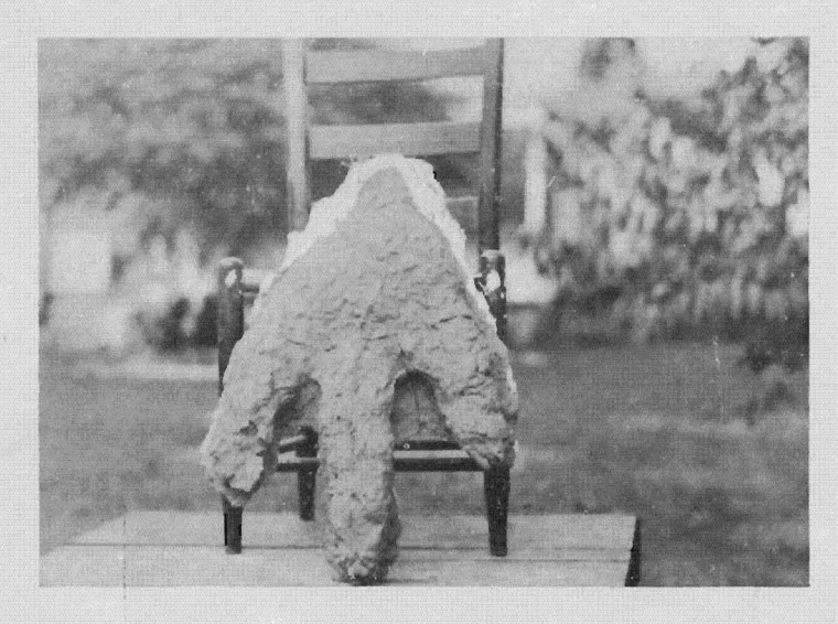
Figure 2. Cast of Dinosaur foot by Mr. H. Curtis Jones.