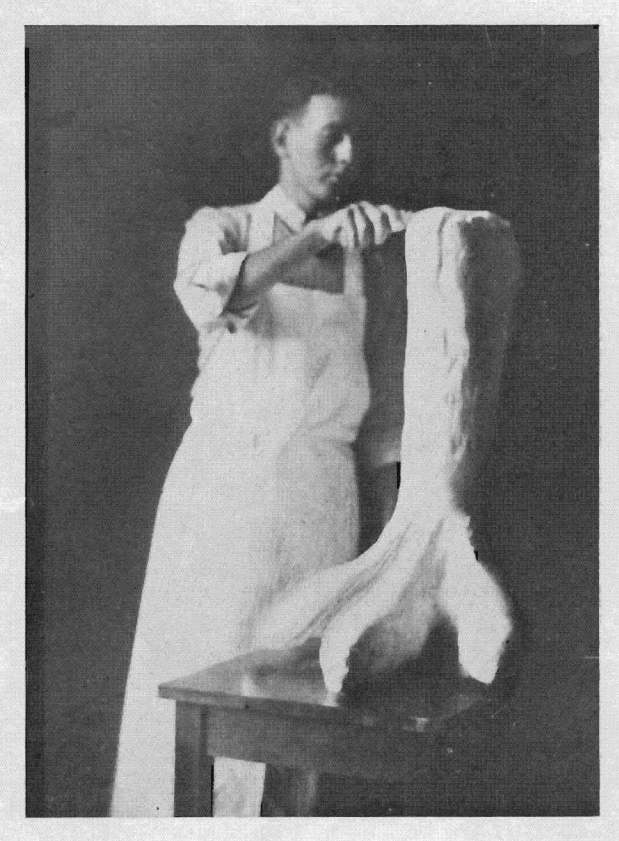
Figure 4. Restoration of Dinosaur foot and lower part of leg.

Figure 2 shows a cast made with modeling clay. The clay was plastered over the bottom, sides, and ends of the toes of the original track to a thickness of about ½ inch; then a core of plaster was poured, which is seen to project above the clay in the top part of the picture. The core was removed and the modeling clay taken from the track and placed on the core. The rear spur or extension shows