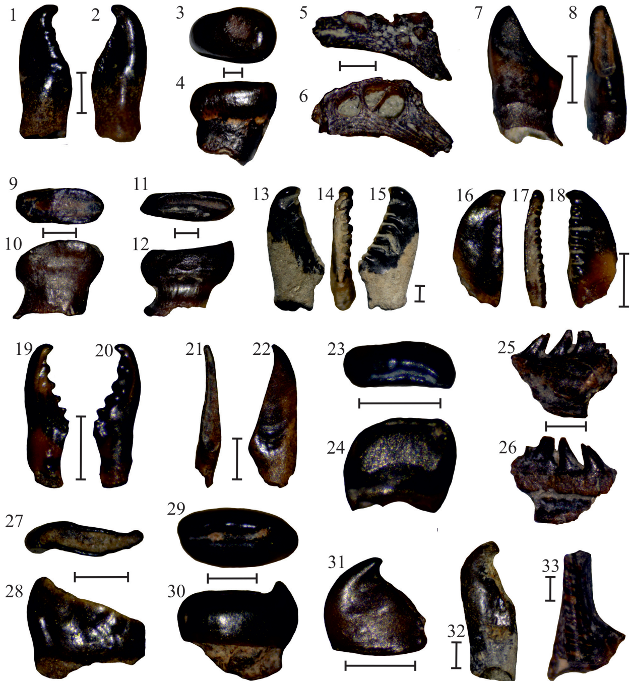
FIGURE 2. Cyprinid fossil remains from Copăceni: 1-2, Leuciscus sp., pharyngeal tooth in lateral (1) and medial (2) views; 3-4, Rutilus cf. frisii , pharyngeal tooth in occlusal (3), and side (4) views; 5-12, Rutilus sp.: 5-6, pharyngeal bone in medial (5) and ventral (6) views, 7-12, pharyngeal teeth in lateral (7, 10, 12), and occlusal (8, 9, 11) views; 13-15, Scardinius cf. ponticus , pharyngeal tooth in medial (13), occlusal (14), and lateral (15) views; 16-18, Scardinius sp. Copăceni, pharyngeal tooth in medial (16), occlusal (17), and lateral (18) views; 19-20, Scardinius sp., pharyngeal tooth in medial (19) and lateral (20) views; 21-22, Chondrostoma sp., pharyngeal tooth in occlusal (21) and lateral (22) views; 23-24, Barbus sp., pharyngeal tooth in occlusal (23) and lateral (24) views; 25-26, Barbinae gen et sp. indet., dorsal fin ray fragment in left (25) and right (26) lateral views; 27-28, Carassius sp., pharyngeal tooth in occlusal (27) and lateral (28) views; 29-30, Tinca sp., pharyngeal tooth in occlusal (29) and lateral (30) views; 31, Abramis sp., pharyngeal tooth in lateral view; 32, Squalius sp., pharyngeal tooth in lateral view; 33, Cyprinidae gen et sp. indet., pharyngeal bone fragment in ventral view. All scale bars equal 1 mm.