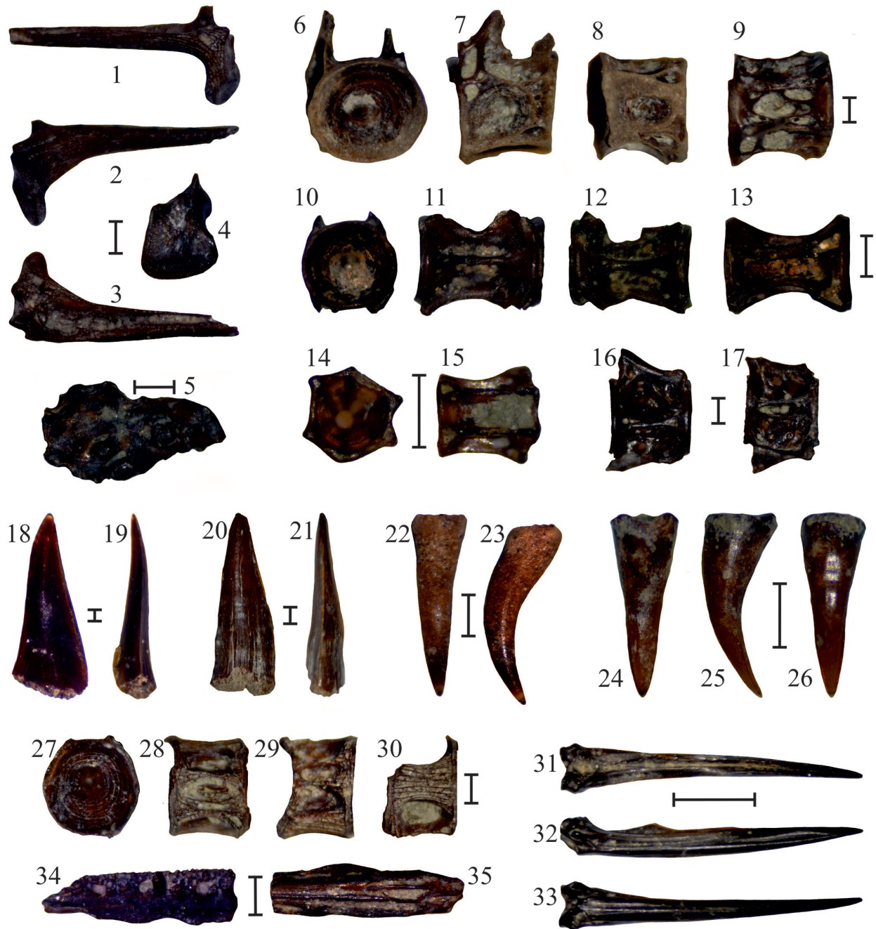
FIGURE 3. Carnivorous fish remains from Copăceni: 1-4 , Silurus sp., first pectoral fin ray in ventral (1), dorsal (2), medial (3), and proximal (4) views; 5 , Silurus sp., cranial bone fragment in dorsal view; 6-17 , Salmonidae gen. et sp. indet., isolated vertebrae in anterior (6, 10, 14), lateral (7, 8, 13, 16, 17), ventral (9, 12, 15), and dorsal (11) views; 18-26 , Esox sp., isolated maxillary (18-21) and palatal teeth (22-26) in anterior (18, 20, 26), lateral (19, 21, 23, 25), and posterior (22, 24) views; 27-30 , Esox sp., isolated vertebra centrum in anterior (27), lateral (28), dorsal (29), and ventral (30) views; 31-33 , Perca sp., dorsal fin ray in posterior (31), lateral (32), and anterior (33) views; 34-35 , Percidae gen. et sp. indet., premaxilla fragment in antero-medial (34) and ventral (35) views. All scale bars equal 1 mm. See text for inventory numbers.