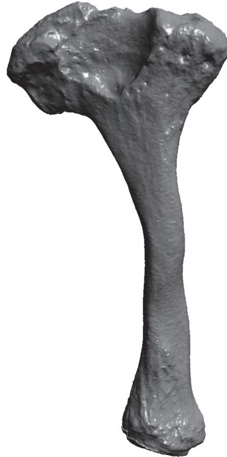
FIGURE 4. Three-dimensional reconstruction of the stylohyal of adult Glossotherium (MNHN 914). Medial view (3D object see online Appendix 2 for animated PDF. paleo-electronica.org/content/2015/1119-stylohyal-of-a-giant-sloth ).

Thirteen parallel marks are observed in the midshaft, which are likely to have been caused by trampling and one at the proximal end (Figures 2.3, 3). The latter shows features of those caused by human agency, seen on other bones of Lestodon from the site, as discussed in Fariña et al. (2014). That mark on the stylohyal was studied using an Olympus SZ61 stereomicroscope under a magnification of 45x and methods based on extended depth-of-field to analyze several features of the mark. The depth of the cut is 0.151 mm with an opening angle of 124°. The presence of asymmetrical shoulders, along with the depth and angle of the cut, resemble the features found in fossil bones