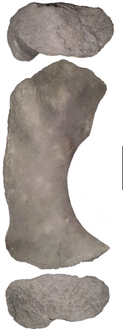
FIGURE 6. Left femur of juvenile Lestodon (CAV 935) in posterior view showing the proximal (top) and distal (bottom) irregular surfaces of the diaphysis. Scale bar equals 100 mm.