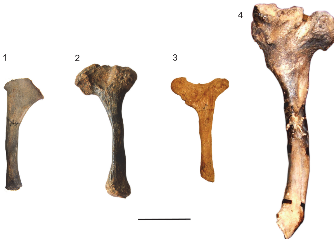
FIGURE 5. Stylohyals of 1, juvenile ground sloth (CAV 476); 2, adult Glossotherium (MNHN 914); 3, adult Scelidotherium (MLP 3-671); 4, Adult Megatherium (MNHN PAM 297). Scale bar equals 50 mm.

stylohyals of Paramylodon harlani . If geometric similarity is assumed between these two morphologically similar and closely related ground sloths (see Fariña et al., 1998 for discussion on body mass), an adult Lestodon armatus must have had a stylohyal of about 125 \text{ mm} \times (4000 \text{ kg}/1500 \text{ kg})^{1/3} = 173 \text{ mm} in length. This difference in size, along with the fact that both ends show the usual morphology of the attachment to cartilaginous areas (Figure 2, Figure 3), leads us to conclude that the individual was a juvenile specimen of L. armatus , whose body mass must have been 1500 \text{ kg} \times (105 \text{ mm}/94 \text{ mm})^3 \approx 2090 \text{ kg} , again proportionally estimated after G. robustum . However, this must be considered a maximum, since juveniles have allometrically larger heads (Gould, 1966).