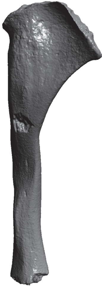
FIGURE 3. Three-dimensional reconstruction of the juvenile ground sloth stylohyal (CAV 476). Medial view (3D object see online Appendix 2 for animated PDF. paleo-electronica.org/content/2015/1119-stylohyal-of-a-giant-sloth ).