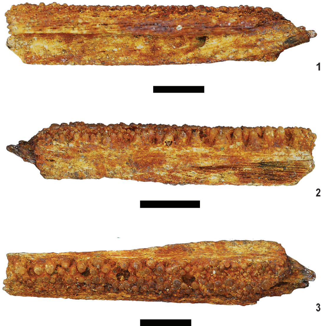
FIGURE 9. Belonostomus sp. ALMNH 1994.31.112. 1, lateral view; 2, medial view; 3, dorsal view. Scale bars equal 5 mm.