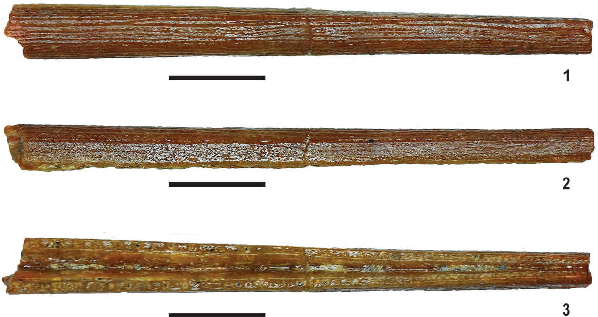
FIGURE 7. Belonostomus sp. ALMNH 1994.24.15 1, dorsal view; 2, right lateral view; and 3, ventral view. Scale bars equal 5 mm.