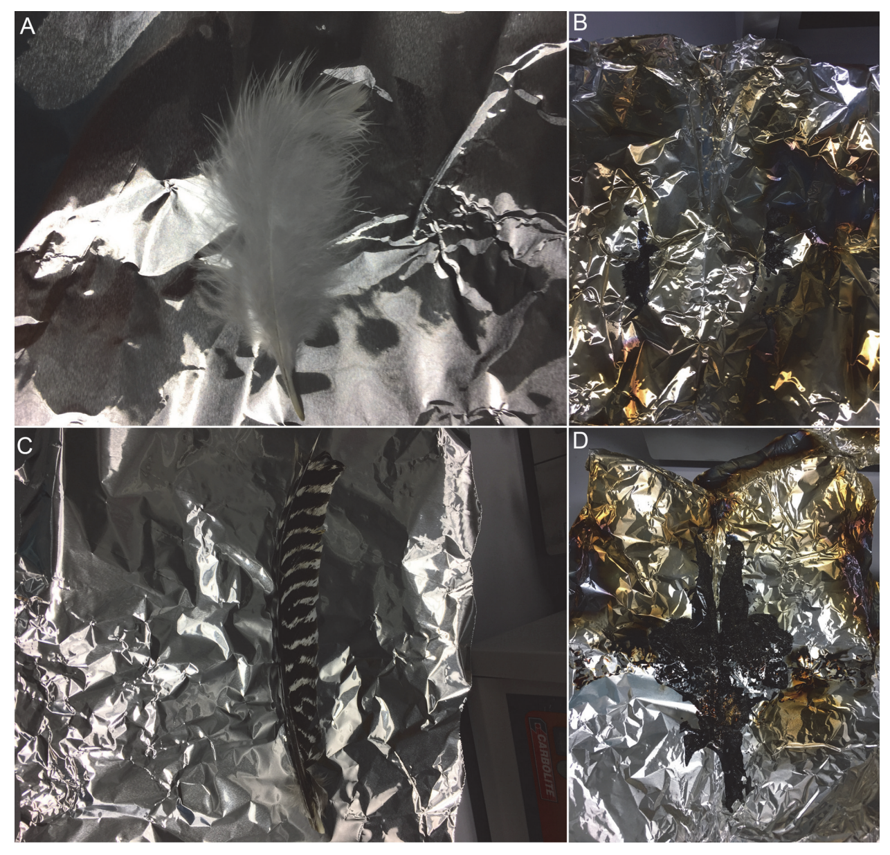
FIGURE 2. Our attempt to replicate high heat feather combustion. White chicken contour feather before, A, and after, B, and brown and white turkey flight feather before, C, and after, D, wrapping in foil and heating in a Carbolite laboratory oven set to 350°C. The oven was turned off a few minutes after it was turned on due to excessive smoke production. The samples were removed shortly after, when the oven had cooled. Modified from the supplemental material of Saitta et al. (2018b).

treatment 2 experimental feather (350° C, 10 years) is consistent with their formation through thermally induced polymerization. Additionally, the detection of organic secondary ions with low hydrogen content in the treatment 2 experimental feather (350° C, 10 years) could be indicative of condensation (i.e., dehydration) reactions that help to form N-heterocyclic polymers.