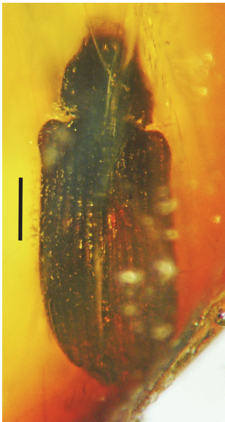
FIGURE 7. Dorsal view of Anthonomus browni sp. nov. in Dominican amber. Bar equals 0.550 mm.

dle; metatibiae 5.6 times longer than wide in middle; tarsi long; first to third tarsomeres conical; fifth elongate; tarsomeres with pulvilli on underside; tarsal claws free, very small, without basal teeth.