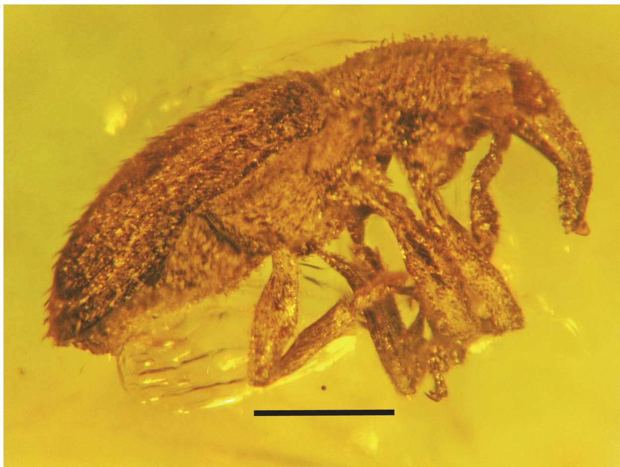
FIGURE 8. Lateral view of Neosibinia lepidosoma sp. nov. in Dominican amber. Bar equals 0.570 mm.