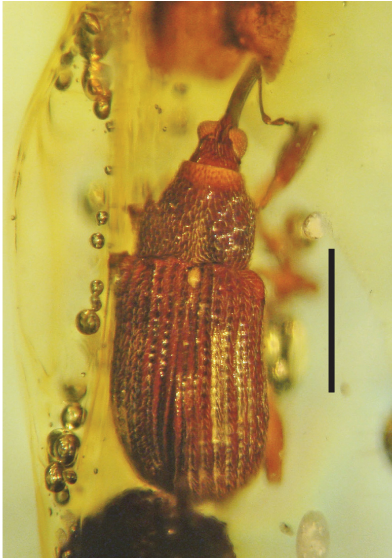
FIGURE 4. Dorsal view of Holotype Anthonomus cruraluma sp. nov. in Dominican amber. Bar equals 0.780 mm.

fourth ventrite; fifth ventrite subquadrately emarginate of male; pygidium sulcate; pygidial channel broad and deep.