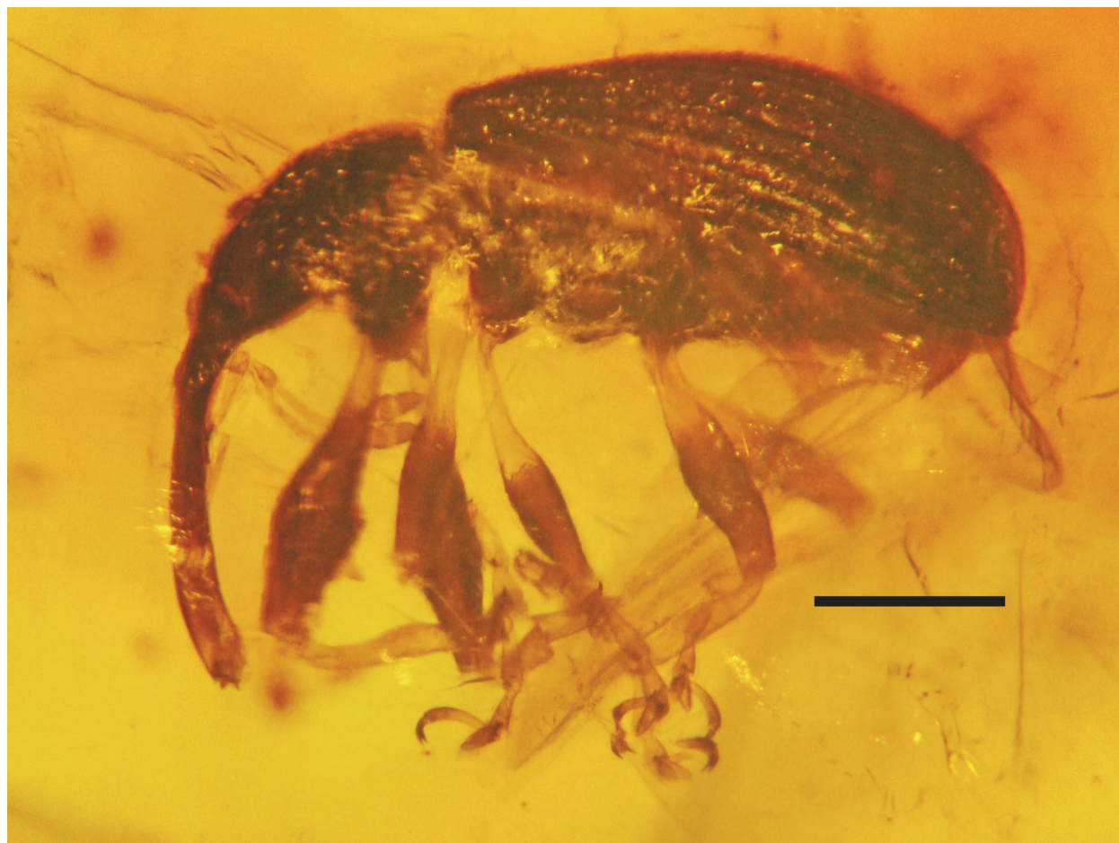
FIGURE 6. Lateral view of Anthonomus browni sp. nov. in Dominican amber. Bar equals 0.630 mm.

as wide as sixth antennomere; club compact, elongate, 5.0 times longer than wide, 0.6 times as long as funicle; first club 1.8 times longer than wide, 1.8 times as long and 1.3 times as wide as seventh antennomere; second club 1.4 times longer than wide, equal in length and 1.3 times as wide as first club article; third club article 3.1 times longer than wide at base, 1.6 times as long as and 0.7 times as wide as second club article, acuminate at apex.