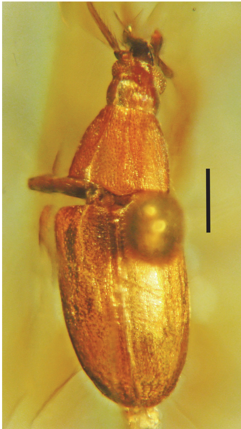
FIGURE 2. Dorsal view of Derelomus thalioculus sp. nov. in Dominican amber. Bar equals 0.440 mm.

quite short, 0.4 times as long as eye, punctate; antennae inserted in apical third of rostrum, elongate, almost reaching base of pronotum; scape elongate, 15.2 times longer than wide, 1.2 times as long as funicle length; funicle with first to seventh antennomeres conical-elongate; first antennomere