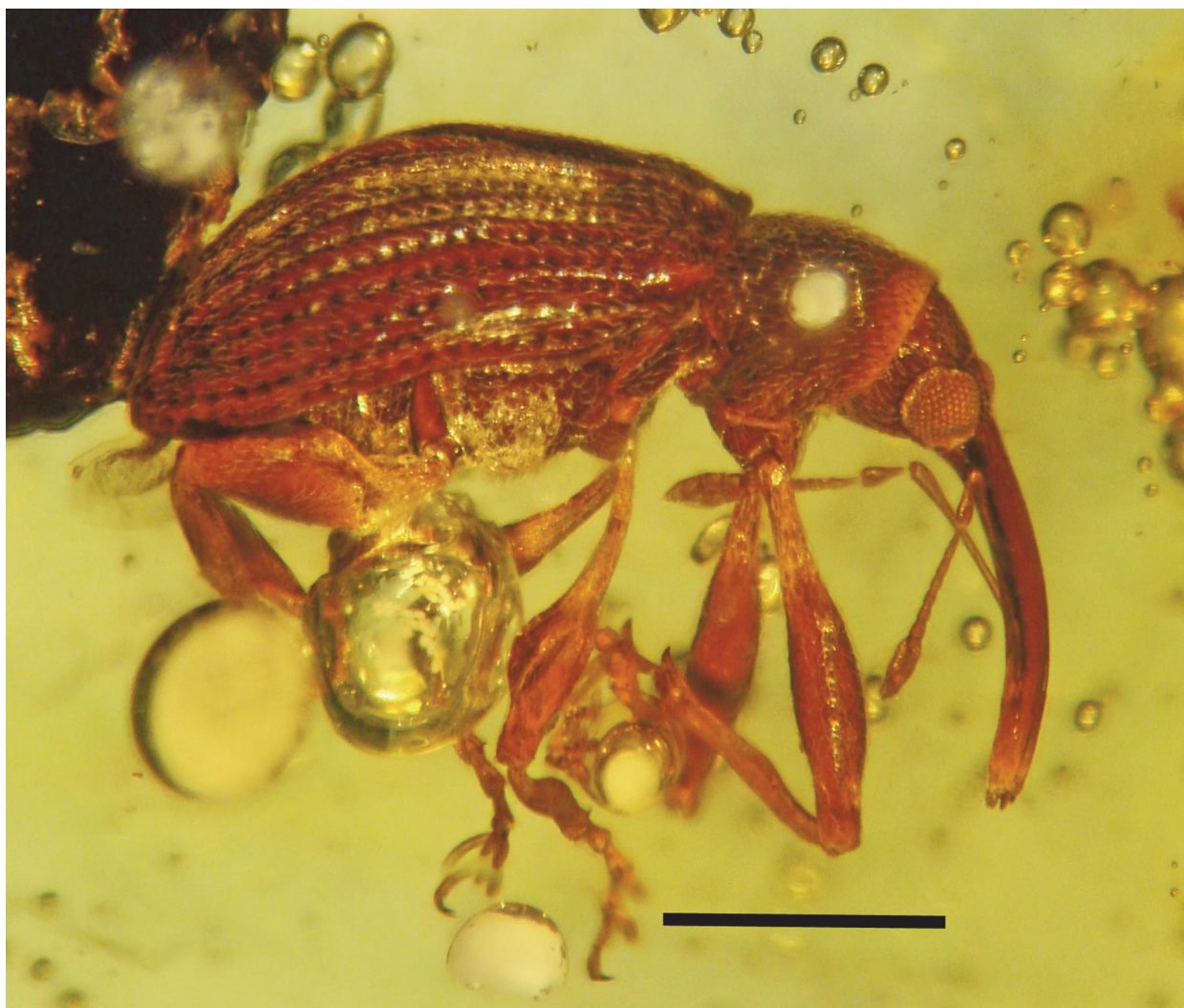
FIGURE 3. Lateral view of Holotype Anthonomus cruraluma sp. nov. in Dominican amber. Bar equals 0.730 mm.

second antennomere; fourth antennomere equal to third antennomere; fifth antennomere 1.5 times longer than wide, 0.8 times as long as fourth antennomere; sixth antennomere equal to fifth antennomere; seventh antennomere 1.6 times longer than wide, 1.3 times as long as and 1.3 times as wide as sixth antennomere; club compact, 2.4 times longer than wide, 0.4 times as long as funicle; first club almost of equal length and width, equal to length and 1.6 times as wide as seventh antennomere; second club equal to first club article; third club article distinctly acuminate at apex.