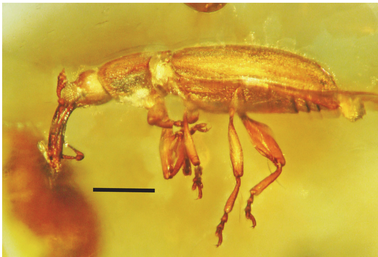
FIGURE 1. Lateral view of Derelomus thalioculus sp. nov. in Dominican amber. Bar equals 0.550 mm.

ing, with basal teeth; metatarsus: first tarsomere 1.7 times longer than wide at apex; second tarsomere 1.5 times longer than wide at apex; third tarsomere bilobed, 0.8 times longer than wide at apex; fifth tarsomere 5.0 times longer than wide at apex, 2.0 times as long as third tarsomere.