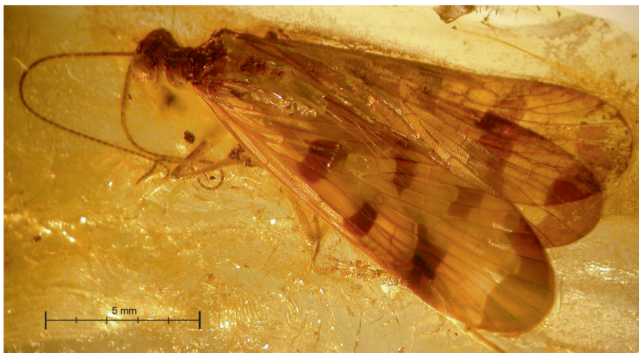
FIGURE 1. Photograph of Panorpodes gedanensis sp. n. – holotype no. 1193-2.

of wing across the Rs fork; A_2 reaching posterior edge in the middle of Rs; one crossvein between A_1 and A_2 ;