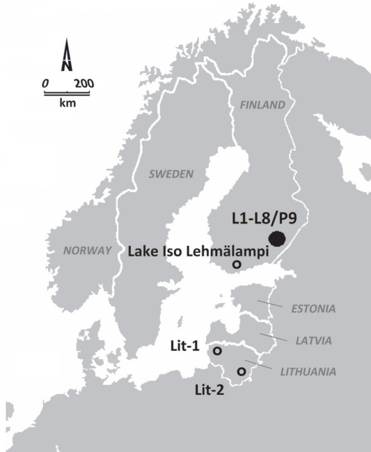
FIGURE 1. Map of North Europe showing the locations of the study site in southern Finland (filled circle) and other late Quaternary palaeoclimate-data producing sites (open circles) mentioned in this study. Lake Iso Lehmälampi is the site of water level reconstructions based on subfossils of the chironomid midge and cladoceran water flea (Luoto, 2009; Nevalainen et al., 2011; Nevalainen and Luoto, 2012). Lit-1 and Lit-2 are tree-ring sites studied by Pukienė (1997) and Edvardsson et al. (2016), respectively.

In general, the processes involving the megafossil deposition are characterised by autochthonous burial. Because of their large size, tree trunks remain minimally transported, especially in peatland sites. In lacustrine conditions, however, a fallen trunk may become captured by lake ice during the boreal winter and transported from the shore. Such minimally transported specimens would, strictly speaking, represent parautochthonous ( sensu Kidwell et al., 1986) plant material. Plant remains are preserved in these environments because of gradual accumulation rates (Greenwood, 1991) and reduced rates of biological and mechanical degradation. These circumstances benefit the preservation of whole or nearly complete plants (Wing, 1988; Rich, 1989), such as megafossils. Analysis of our data to illustrate the pine population dynamics followed previous analyses (Edvardsson et al., in press ). The depositional histories of tree accumulation were obtained as the replication curves of each site chronology demonstrating the number of tree-ring series (i.e., the number of trees) per calendar year. Temporal fluctuations in the replication curves were plotted to depict the periods when the availability of subfossil tree trunks in a given site was either increased or decreased. These fluctuations were compared amongst the lake sites and between the lake and peatland sites, as well as with other proxy data indicative of variations in past climatic conditions and water table levels.