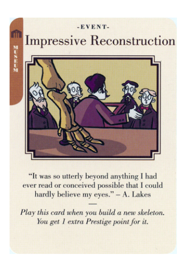
Figure 4. Impressive Reconstruction Event card.

The other issue is one about game play. The instructions are quite short for a game of this type. The entire set if rules can fit on the two sides of an 8 1/2 by 11 inch sheet of paper. Terse instructions are generally a good idea for card games and the game has obviously been well play tested (the credits list 17 play testers), but one more aspect should be included. Many CCG's have rules about timing, that is, what order certain cards or effects take affect if they happen at the about same time. Multiple Event cards can be played at the same time by different players, and it sometimes it has to be decided what order they should take affect. At my table, we decided to resolve the Events in the order they were played from last to first. This