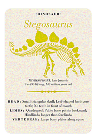
Figure 2. Stegosaurus Dinosaur card.